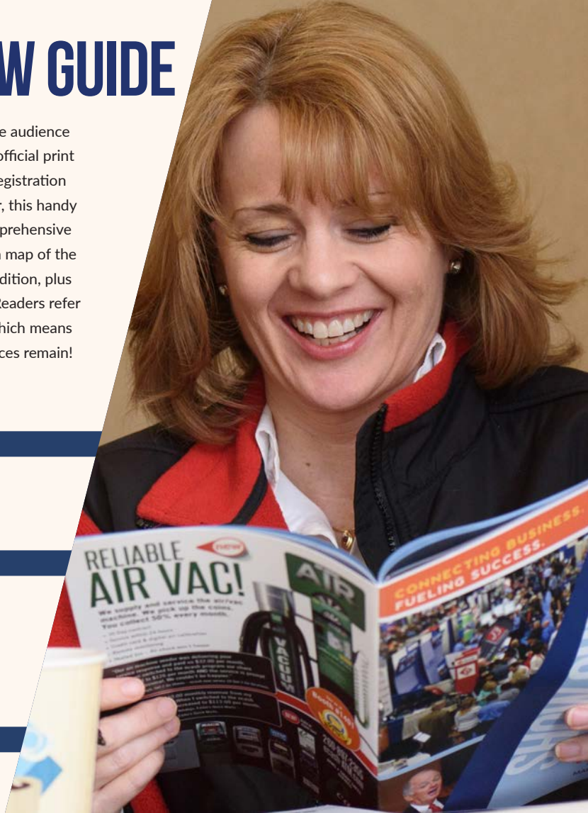
1/8 Page Block